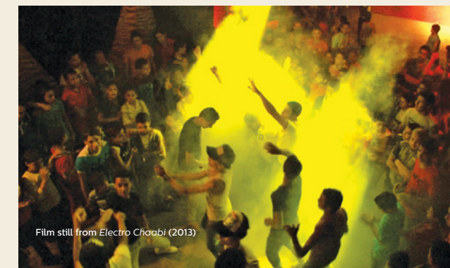
Film still from Electro Chaabi (2013)

For more information on these and other events related to The World of the Fatimids, please visit agakhanmuseum.org .