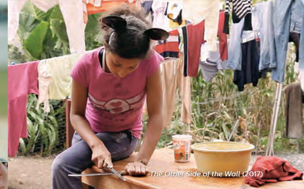
The Other Side of the Wall (2017)