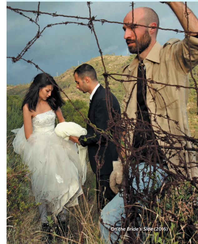
On the Bride’s Side (2016)