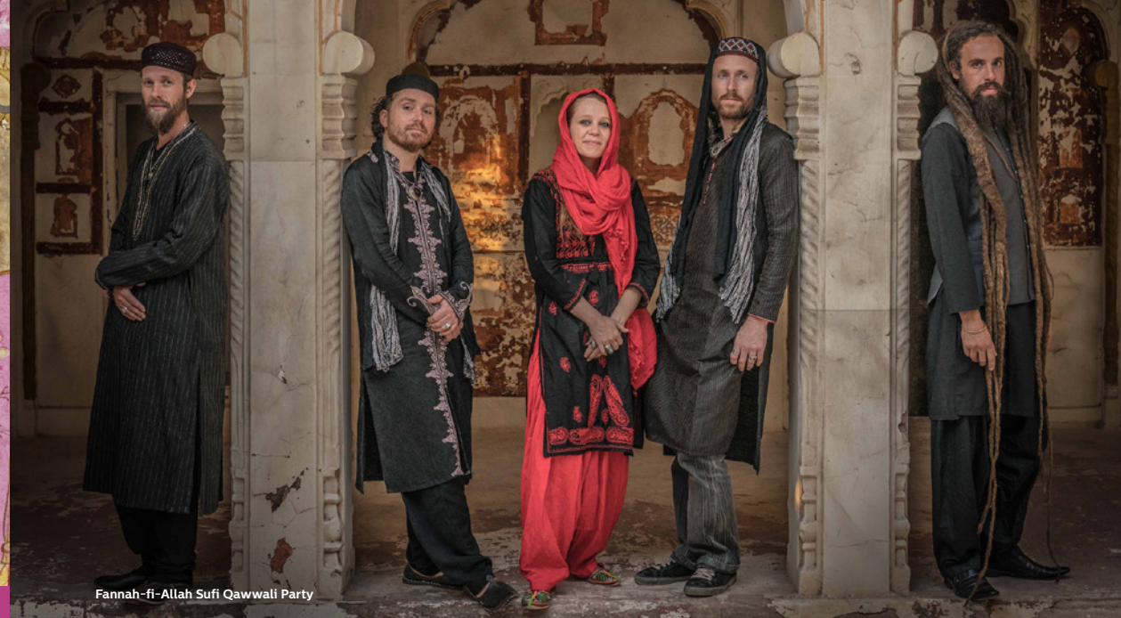
Fannah-fi-Allah Sufi Qawwali Party

Thursday, September 8, 1–2 pm Free with Museum admission