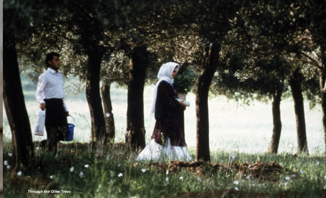
Through the Olive Trees