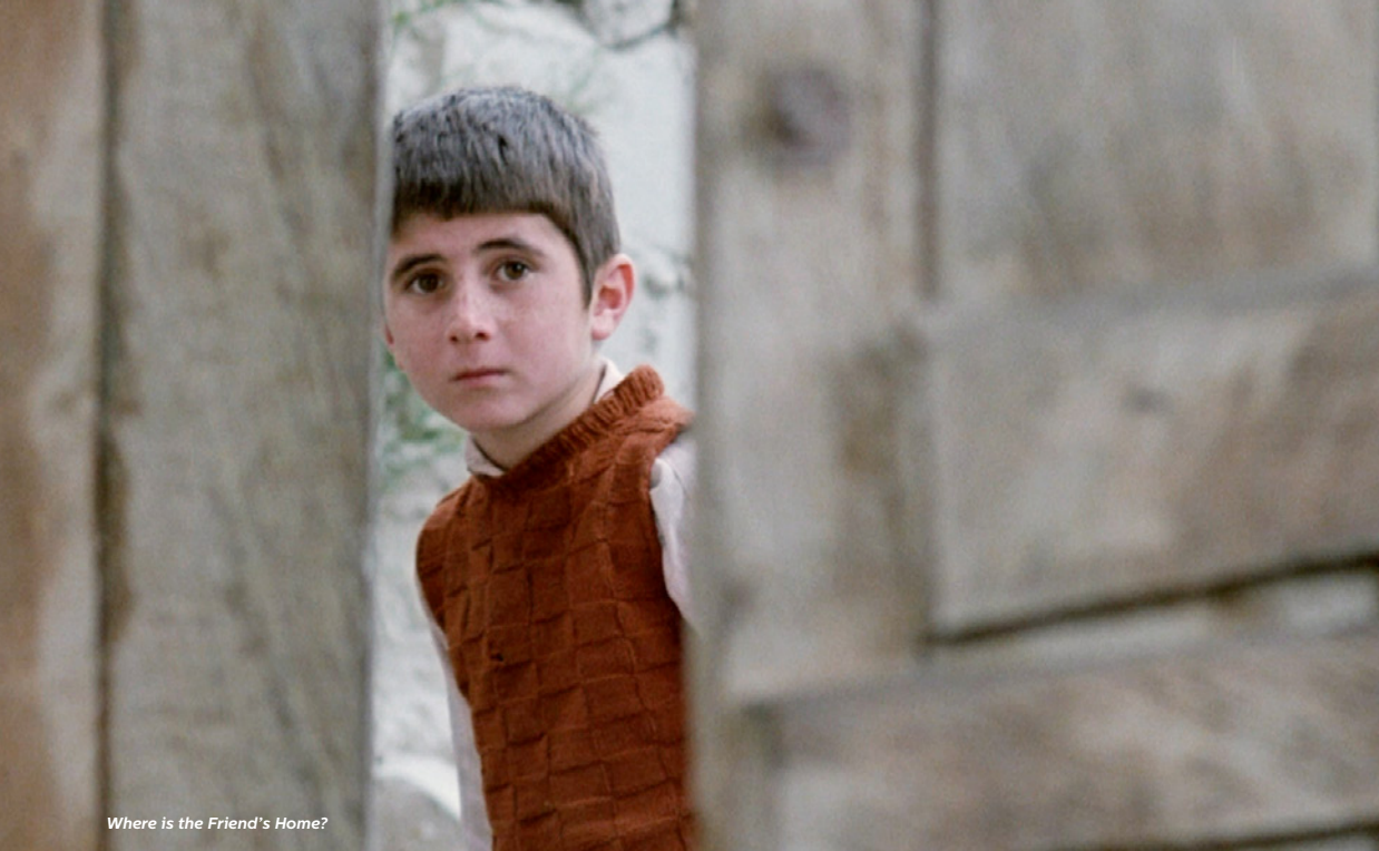
Where is the Friend's Home?