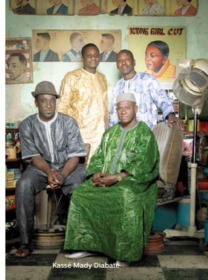
Kassé Mady Diabaté

Through the Olive Trees (Zir-e Derakhtan-e Zeytun) 1994, 103 min.