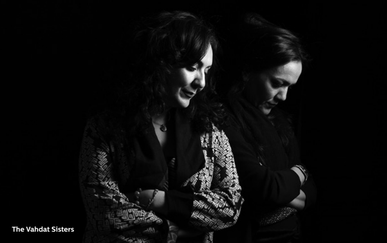
The Vahdat Sisters