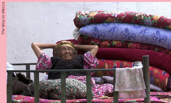
The Way to Mecca