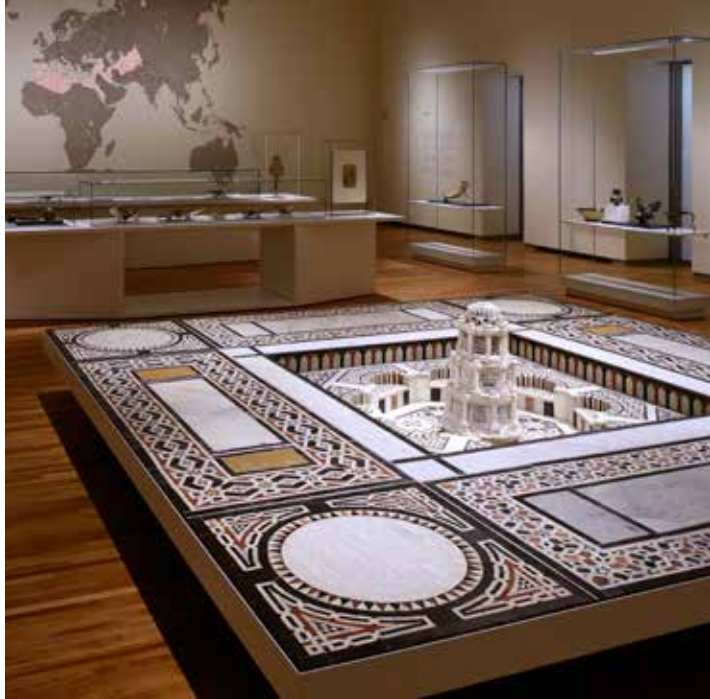
Above right: Fountain, Egypt, 16th century and later, AKM960.