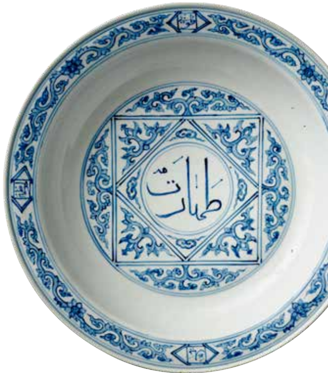
Detail of Ablution Basin, Jingdezhen, China, 1506–21, AKM722.