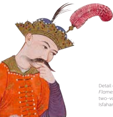
Detail of Siyavosh Rides Through the Flames , folio 92r from the first volume of a two-volume Shah-Nameh (Book of Kings), Isfahan, Iran, 1654, AKM274.