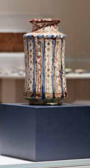
Above left: Ceramics on display in the Aga Khan Museum Collections gallery.