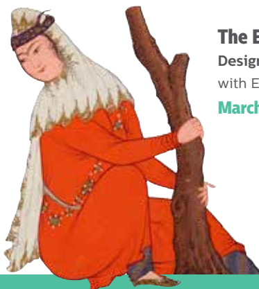
Left: Detail of A Tiger Approaches a Woman by a Pool , folio 347r of the Anvar-e Soheylī , Qazvin, Iran, 1593, AKM289.