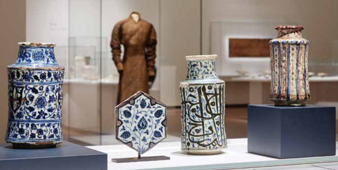
15th-century Syrian Pharmacy Jars ( Albarelli ) displayed with a tile from the same period in the Museum Collections gallery.