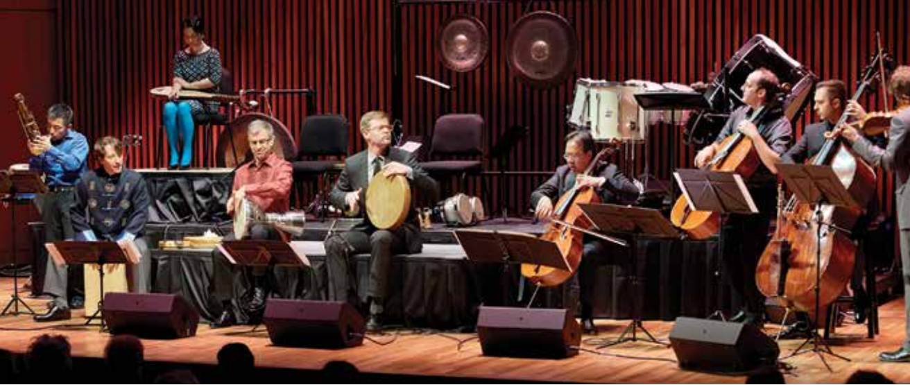
The Silk Road Ensemble with Yo-Yo Ma inaugurating the Museum auditorium on September 13, 2014.