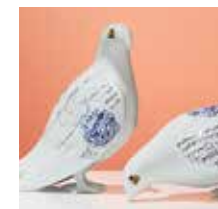
Home Ground: Contemporary Art from the Barjeel Art Foundation

December 13, 2014 – April 26, 2015, organized by the Asian Civilisations Museum, Singapore – A groundbreaking exhibition revealing ancient connections between China and the Arab world.