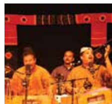
Fareed Ayaz, Abu Muhammad Qawwal and Brothers September 2014

– 14th-century South Asian music for modern audiences.