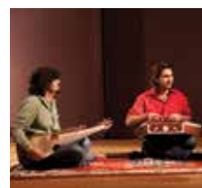
Footsteps of Babur May 2015

– One traditional throat singer, one contemporary.