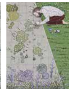
A Garden Within a Garden , 2014 by Imran Qureshi Gift of the Jinah Family, 2015

— This delicate diptych is both a permanent record of an ephemeral work and an ode to traditional miniature painting. The Garden Within , a site painting in the Aga Khan Park, was commissioned by the Museum for our opening. This smaller piece depicts the artist creating the larger artwork.