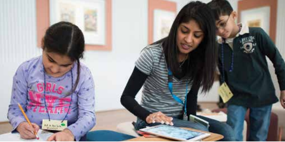
Workshops and courses explored traditional techniques of paper-making, gilding, and manuscript illumination and introduced the history of Islamic art in all its forms.