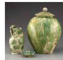
The Lost Dhow: A Discovery from the Maritime Silk Route