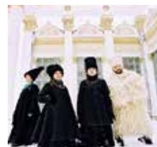
DakhaBrakha November 2014

– 14th-century South Asian music for modern audiences.