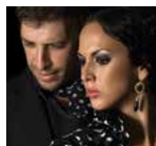
Focus on Flamenco Series October 2015

– Three master musicians from Afghanistan, India, and Tajikistan.