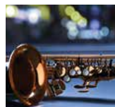
Arab Jazz Series September – December 2015

– An exploration of the Arab, Ladino, and Gitano influences on this evolving art form.