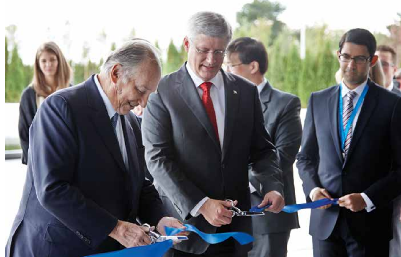
His Highness the Aga Khan and the former Prime Minister of Canada, the Right Honourable Stephen Harper, inaugurate the Museum on September 12, 2014.